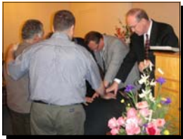
Praying & laying on hands for two deacons