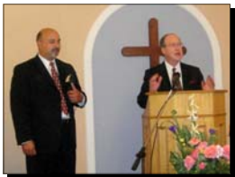
Preaching on Faith Promise Giving