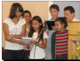
Young people singing during the service