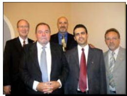
The first two deacons of the church