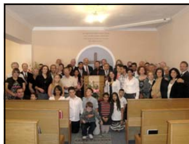
Zakynthos Bible Baptist Church