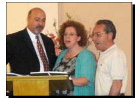
Singing during the invitation